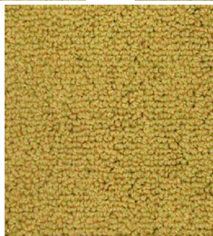
Flexisperse 305 Formula