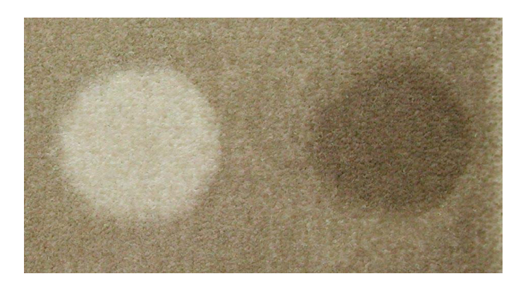
Flexiclean CC-630 Extraction Cleaner

26 oz. cut pile, nylon 6,6 tenth gauge, carpet squares (free of any prior dye or stain protection treatments) were used in this evaluation.