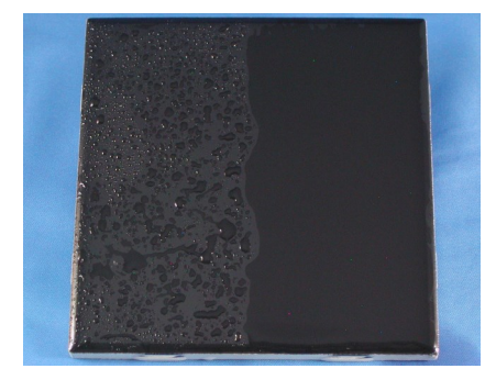
Figure 2: Right half of tile treated with 0.5% Flexipel SR-80 exhibits complete hydrophilization.