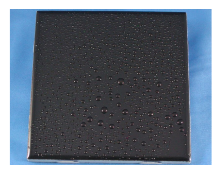
Figure 1: Untreated ceramic tile exhibits hydrophobic nature.

These photographs show the remarkable protection afforded surfaces when treated with Flexipel SR-80. The right half of the tile was treated with a light coating of Flexipel SR-80 at 0.5% then rinsed under cold water (Fig. 2). The tile was then allowed to dry. Once dry, the tile was soiled repeatedly with a standard soap scum and hard water solution then rinsed with cold water (Fig. 3). As the photo demonstrates, the treated half on the right has resisted deposits and remains clean after repeated exposure to hard water and soap scum (Fig 3).