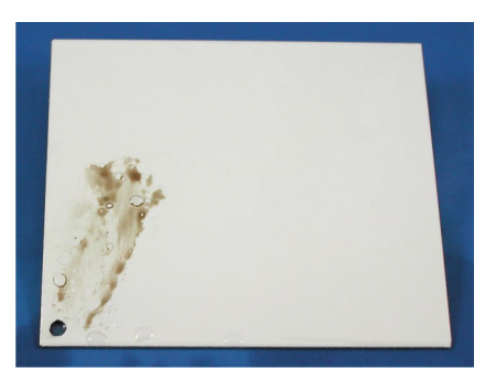
Figure 4: After rinsing, the hydrophilic right side of the panel readily releases soil.

This information relates only to the specific material referred to herein and not to its use in combination with any other material or in any process, unless explicitly stated herein. Such information is, to the best of our knowledge and belief, accurate and reliable as of the date compiled; however, no warranty, guarantee or other representation is made as to its accuracy, reliability, or completeness, or regarding any liabilities arising from others' patent rights. 20220421