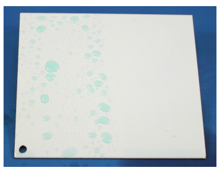
Figure 2: Right half of panel treated with 0.5% Flexipel SR-80 exhibits complete hydrophilization.